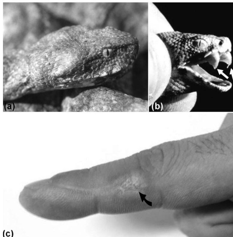
Figure 1. (a): Blunt-nosed viper, Macrovipera lebetina lebetina ; (b): venom apparatus in a juvenile snake; (c): the view of the scar and edema (arrow).

The victim's right hand finger was pricked by right tooth of the great viper (Figure 1a, b) at 16:00 o'clock and the venom was injected into the victim without showing any resistance, and the victim did not feel pain. After biting, only 1-2 drops bleeding were seen and the first main symptom was edema