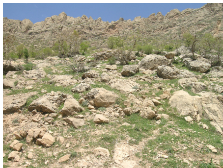
Figure 3. General view of new locality for B. s. aporus in Çetinkol village, Siirt. Date: 01.May.2009.